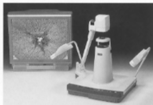
MG-600 on ELMO EV-4400AF Presenter

The enlarged scientific view is a fun and great impression to all the students.